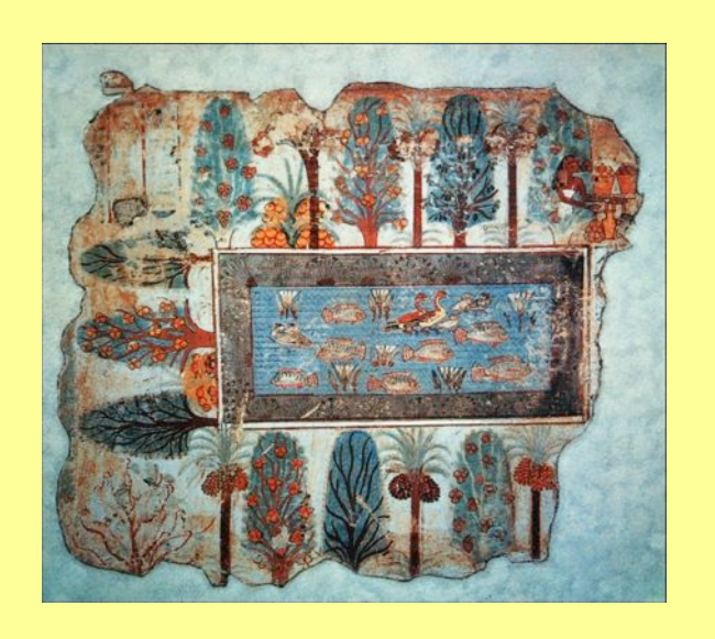
"Pond in a Garden", fresco from the Tomb of Nebamun.

The garden depicted in this quilt was inspired by an ancient painting in the tomb of Nebamun, an Egyptian official. It is used with permission o The British Museum , London. Eleven paintings are in the complete collection. Ann Fahl is a creator and purveyor of quilts for sale .