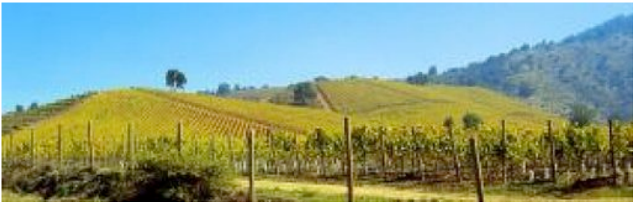
Chardonnay vineyards.