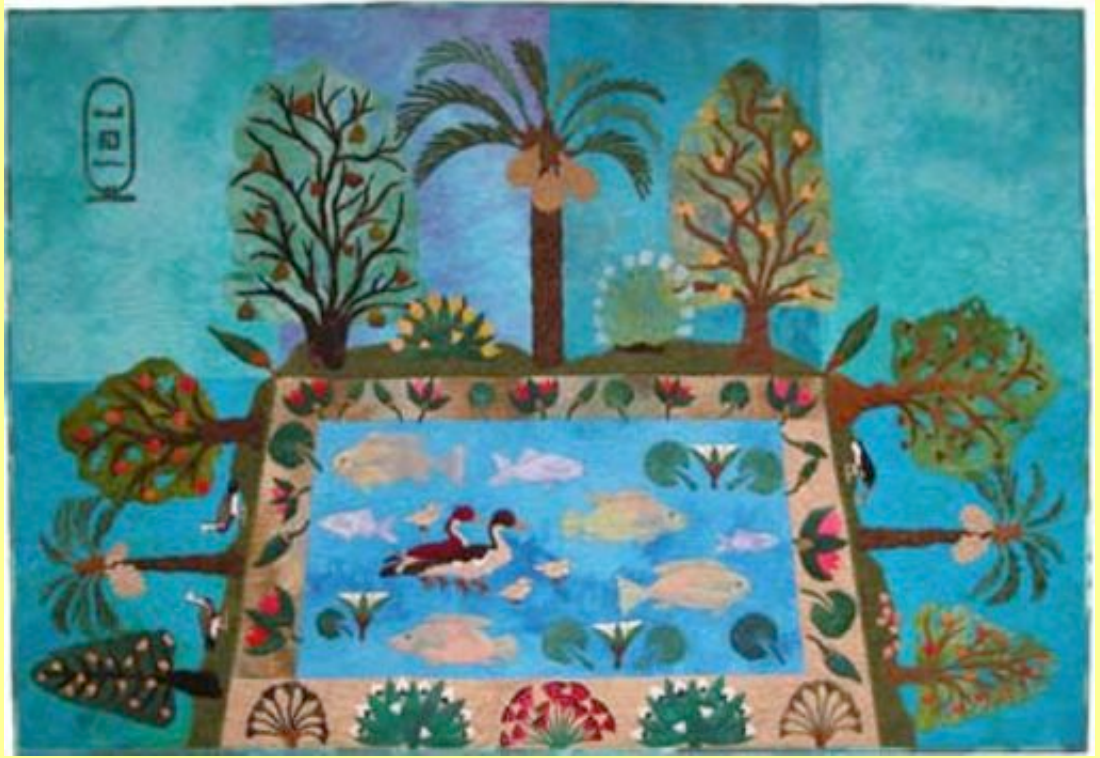
Quilt depicting an Egyptian water garden. Photo and caption from the website <a href="http://annfahl.com">http://annfahl.com</a>.

Both royal and wealthy Egyptians loved water gardens, as they were a place to sit and enjoy the lush cool water and rich plant life that were such a contrast to their surrounding desert environment. I have changed the perspective of the pond somewhat to give us a slightly different view of the scene.