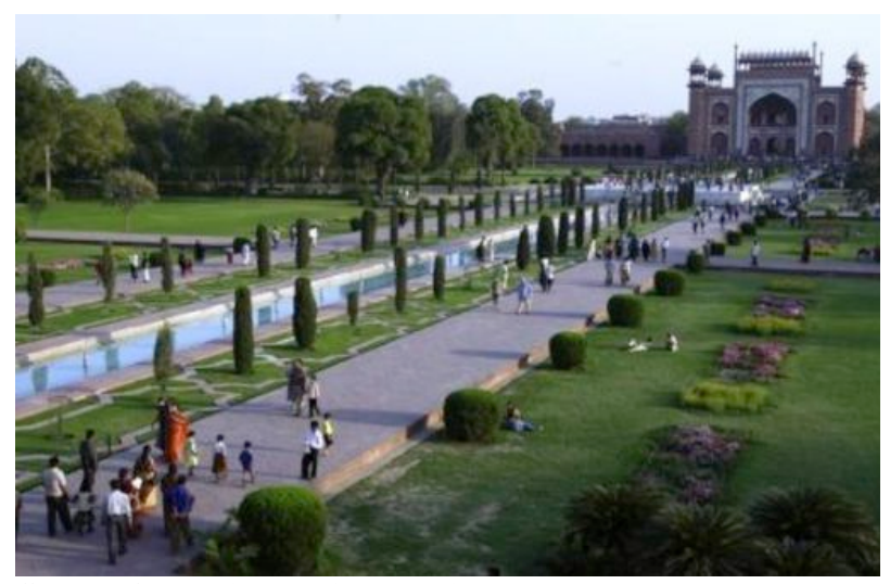
Garden of the Taj Mahal incorporating water, pathways and a strong geometric design typical of a paradise garden.

This style of garden design was eagerly adopted by the French, who after warring with Italy, brought back their ideas, starting with Charles VII and ending with that rascal, Louis XIV, whose Palace of Versailles opened in 1682. For the French, nature was to be controlled, reflecting their penchant for unity and geometrical balance. Other royal residences soon followed suit, notably Holland, Austria, Spain and England.