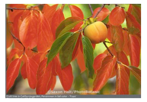
Fuyu persimmon's fall colors in a California garden.