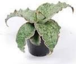
Silver Blue Sanseveria

Sanseveria kirkii 'Silver Blue' (Star Sanseveria) - This evergreen succulent grows in part sun in well-drained soil and looks great in low light. The thick leathery blue-green leaves have a mottled pattern, darker longitudinal lines and very wavy edges. Most Sanseveria are not frost hardy and it might be hardy to 40 degrees.