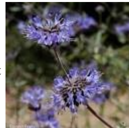
Salvia Allen Chickering

S. x 'Allen Chickering' (Sage) - This is Richard's favorite plant. He thinks the gray-green leaves are great, loves the lavender flowers and how the plant smells. The parents of this dense mounding shrub that grows in part shade to full sun (zones 8-9) in well-drained soil are S. leucophylla and S. clevelandii. It gets to be 5' tall and wide. The gray-green leaves are 1" long. Whorls of light purple flowers start appearing in summer. It is a great habitat plant, attracting finches (in the fall), bees, butterflies and hummingbirds. It is hardy to 15 degrees. Please do not overwater.