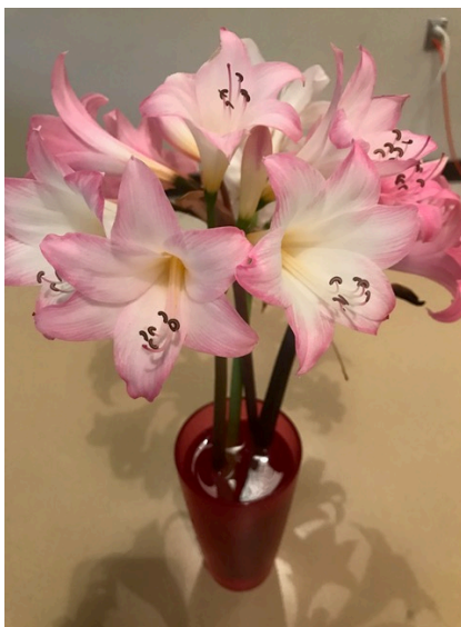
Amaryllis belladonna (Naked-lady, Belladonna Lily)