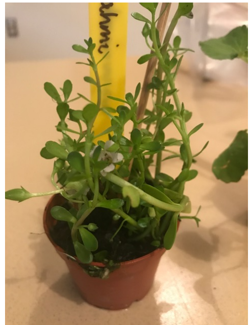
Bacopa monniera (Brahmi, Herb of Grace)

Bacopa monniera or Herpestis monniera 'Bacopa' (Waterhyssop, Brahmi, Thyme-leaved gratiola, Herb of Grace) – This perennial medicinal herb grows in wetlands (zones 9-10). It will grow in dappled sun or shade and needs regular watering. Please don't confuse this medicinal Bacopa with the ornamental one (Sutera). This Bacopa helps relieve stress as well as improve brain function. It also produces small white flowers.