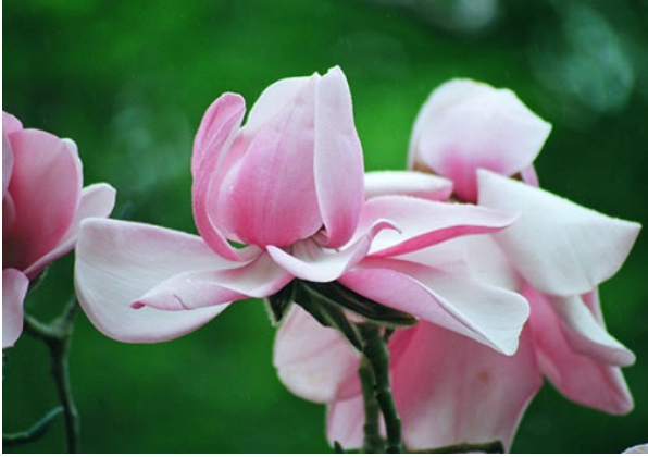
Magnolia campbellii