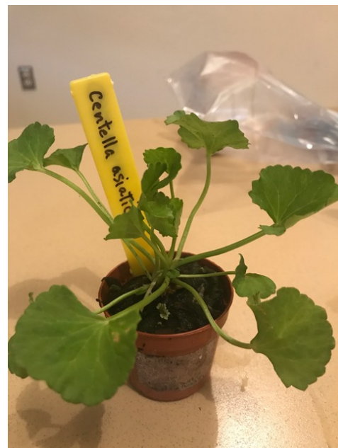
Centella asiatica 'Gotu Kola' (Pennywort)

Amaryllis belladonna (Naked-lady, Belladonna Lily)– This frost hardy bulb from S Africa (zones 7-10) will grow well in our area in full sun. They are sometimes fragrant and you