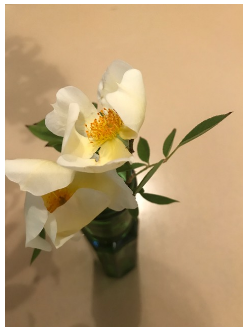
Rosa 'Happenstance'

This is not the only rose with a story, in fact, the history of roses has links to many events of historical