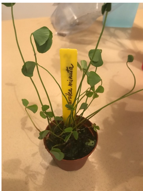
Marsilea minuta 'Sushni' (Clover Fern)

Marsilea minuta 'Sushni' (Clover Fern, European Watercress) – This 4 leaf perennial forms low mats and grows in full or part sun (zones 8-11) in sandy, well drained and even wet soils. The leaves can be used fresh in salads, steamed and even ground up. It has sedative (contains marsiline), anti-inflammatory, anti-cholesterol and anticonvulsant properties. Reproduction occurs from the sporocarps.