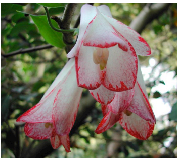
Lapageria rosea 'Collinge' (or 'Dr. Bullock')