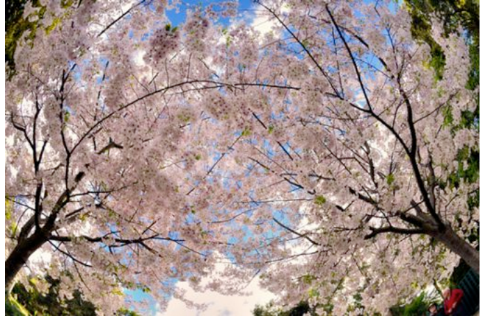
"Looking Up in Gamble Garden"