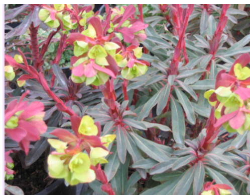
Euphorbia amygdaloides 'Purpurea'