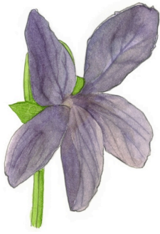
Viola odorata.

The leaves and flowers of the violet plant are used for both culinary and medicinal purposes. Fresh, dried or preserved violets garnish salads (add vinaigrette first), pastries and beverages. They can flavor desserts or be added to poultry or fish stuffings. Violet essence is used to perfume cakes, ice cream, confectionery and liqueurs. Properties: expectorant. Violet is said to relieve migraines and fever. Made into a tea, it is said to be a mild sedative.