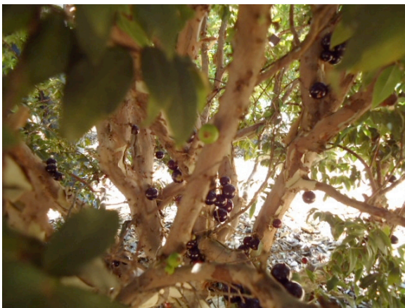
In August Katie saw this old friend, the jaboticaba tree, at Emma Prusch Park and was inspired to write a poem ...

It is slow-growing and unimpressive Standing about 7 feet tall Its branches and leaves are pretty, but unexpressive It's a bush and that is all! I searched in spring for the flowers Without a trace Their presence beyond my powers This tree is a waste of space! But WAIT - Summer's ARRIVED And what do I now spy Beyond the leaves--the branches alongside But little black fruits for me to try Umm good! What a treat! Such unusual good fruit to eat! Poor little friend I misjudged thee Now for me, I gotta have a JABOTICABA tree! ~Katie Wong