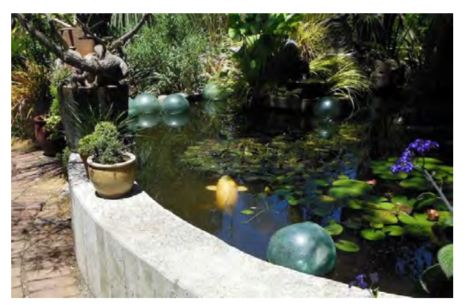
Water plants and garden art in Marcia's garden. Photo: Mary Kaye, July 2013.