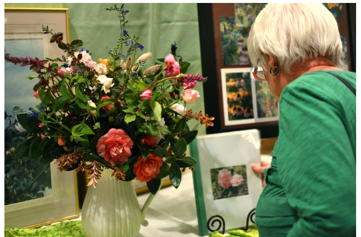
A bouquet of flowers from Barbara's garden and photo of one of her roses.