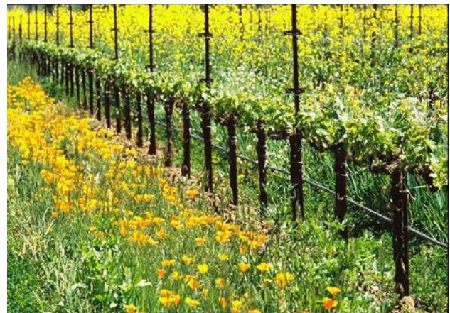
Poppies and vines