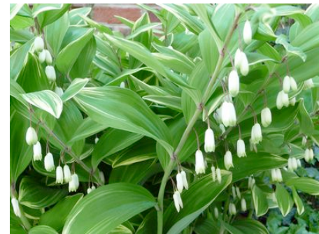
Polygonatum odoratum 'Variegatum', Solomon's Seal