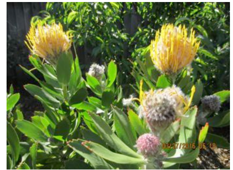
Leucospermum 'Veldfire' grown by Monterey Bay Nursery, one of the fabulous Hot Plant Picks for 2016.