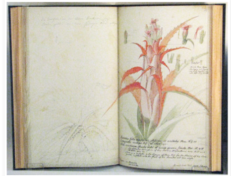
Bromelia pinquin in a sketchbook of George Dionysius Ehret, one of the best botanical artists of his day.