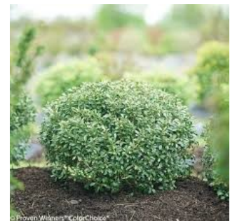
Sky Box Japanese Holly