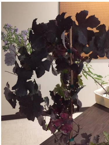
Vitis vinifera 'Purpurea'

Vitis vinifera 'Purpurea' – This ornamental grape vine grows in full sun (zones 6-9) in well-drained soil. The green leaves that appear in the spring turn to a lovely purple in the fall. Small clusters of purple-black sweet grapes, with seeds can be eaten fresh off the vine or used to make jam. It is her go to grape in making grape jelly.