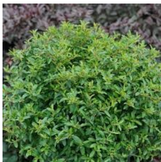
Juke Box Pyracomeles

Boxwood Blight is a fungal disease which is spread by spores carried on infected nursery stock, tools, clothing and even greens in holiday decorations. These spores can persist in the soil for up to five years. There is no cure but cultural practices and spraying with a fungicide containing chlorothalonil every 7 to 14 days during the growing season can suppress the disease. It is important to prune out any affected growth, clean up any debris on the ground and double bag the waste and throw in the trash. Do not compost it! Be sure to sterilize your pruning tools with a 1:9 bleach to water mix and wash any clothing that has come in contact with the spores. Too much trouble? Plant resistant varieties of boxwood such as North Star, Sprinter littleleaf, ‘Green Beauty’ littleleaf, or ‘Winter Gem’ Korean boxwood. Or, even better, plant Sky Box Japanese holly ( Ilex crenata ), Bordeaux Dwarf Youpon holly ( Ilex vomitoria ), Blueberry Glaze Blueberry ( vaccinium ), or Juke Box Pyracomeles . These plants do not get the blight and there will be a very similar look to boxwood.