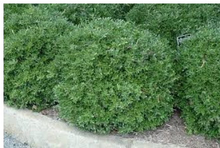
Bordeaux Dwarf Youpon Holly