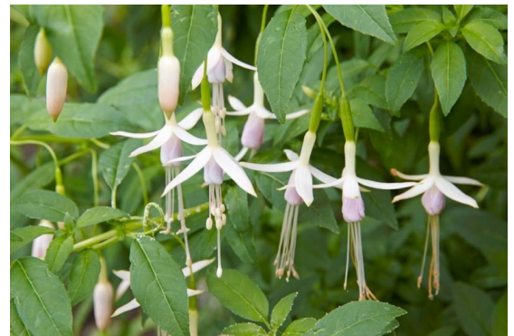
Fuchsia magellanica v. molinae

Fuchsia magellanica var. molinae 'Maiden's Blush' (Maiden's Blush Fuchsia) – This semi-evergreen is a Dan Hinkley introduction that grows in full to part sun (zones 6-10) in any type of soil with regular watering. It gets to be 3-5' tall and wide (3' tall at Lorena's). It has opposite lanceolate light green leaves with serrated margins. It has started blooming and the hanging flowers have 4 spreading sepals and 4 erect light pink petals. It is a great hummingbird plant.