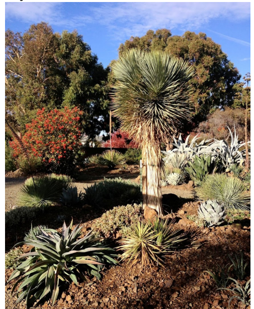
Ruth Bancroft Garden