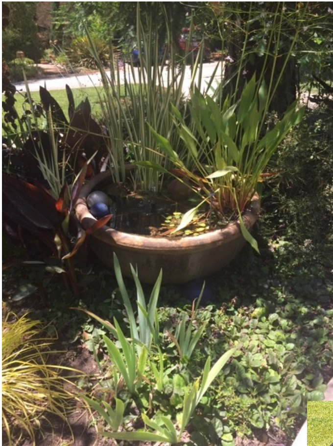
One of the many little vignettes around the garden that make it so special