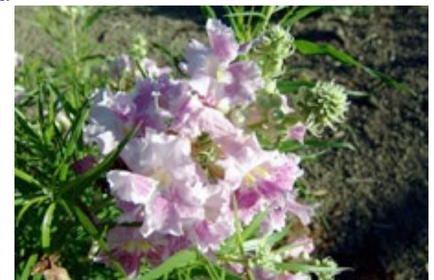
Spring flowers await us on the Going Native Garden Tour –see page 2 for info on how to sign up to attend and/or volunteer.

April 13, 2016 Ted Kipping, "Victor Reiter's Garden." May 11, 2016 Kora Dalager, "Container Plants: The Ultimate Small Container Garden."