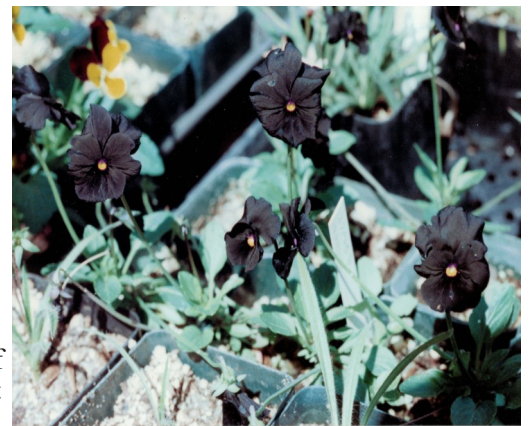
Viola 'Molly Sanderson'