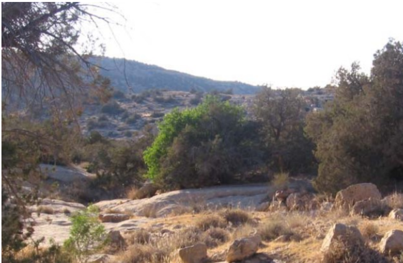
Juniper forest habitat

The flora of southern Lebanon near Petra is a juniper forest similar to some of our eastern California high desert habitat. However their