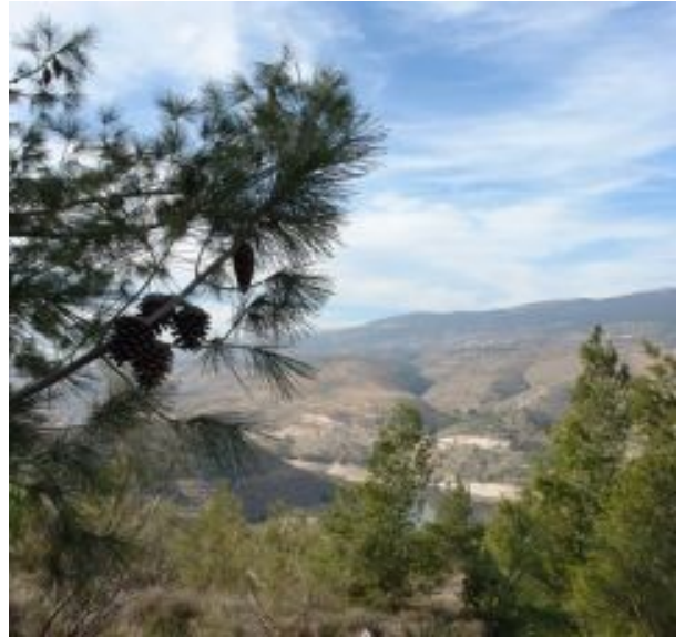
View of King Talal Dam and reservoir from garden

The garden is arranged like the flora of Jordan with examples of each of its major plant zones starting with the deciduous oak woodland. The oaks of this habitat were Quercus ithaburensis , Jordan’s national tree, which has very large acorns. Other trees include Ceratonia siliqua , our familiar carob trees, Pyrus syriaca , Syrian pear and Amygdalus coummunis , the wild almond. There are very few intact oak habitats remaining in Jordan because goats like to climb the trees and eat them. The perennial plants that grow in this habitat include many names familiar to us including Lupinus pilosus , usually a deep blue but sometimes seen in a coral color, Anemone coronaria , our familiar widely grown anemone that forms big fields of red flowers in the wild, Fritalleria persica , Persian lily, Ranunculus asiaticus , Alcea setosa , a pink hollyhock that grows like a weed in Jordan, Tulipa agenensis , a brilliant red tulip species native to the