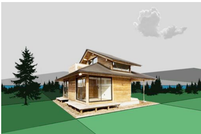
RIKYU House from Joinery Structures. “RIKYU House blends the elegance and sensitivity of traditional Japanese design with a sincere and holistic commitment to green building. Through a patented building system enabling custom design and the use of standardized parts, RIKYU House is aesthetically beautiful, environmentally conscious, and affordable.” Photo and caption: http://www.joinerystructures.com .