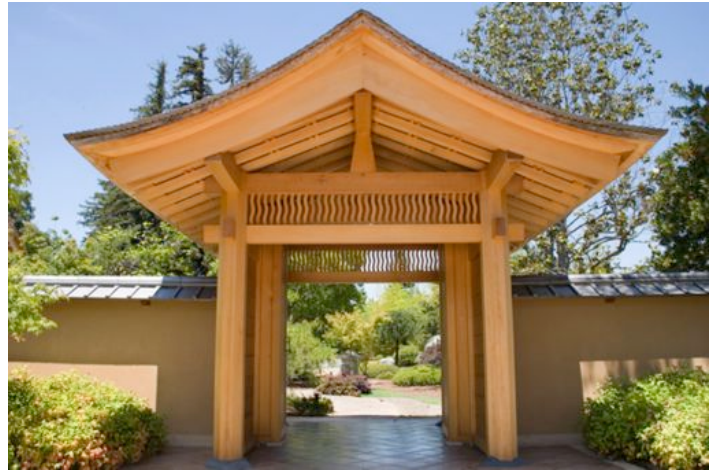
Custom home design by Joinery Structures (for a complex in Woodside, California). Photos from Joinery Structures, http://www.joinerystructures.com

Paul Discoe’s lectures on Zen design principles, Wabi Sabit and related topics can be found on YouTube. For more info: http://www.joinerystructures.com .