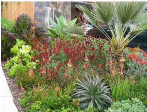
Dyckia x 'Morris Hobbs' at Trejo Garden, by David Feix Landscape Design. Use of Linaria reticulata as temporary filler annual color until the succulents and Dyckias filled in. The Linaria is a classic Annies Annuals plant that can give brilliant flaming red color in spring, and complements the oranges of the Bulbine frutescens and Arctotis , as well as the orange flowers of the Dyckia and Cotyledon macrantha when they come into bloom.

The first garden David described, considered "high-end" and created with a hefty budget, wowed our audience with its Moroccan theme of straight lines, multi-level planters, terraces, and liberal sprinklings of palms and other tropicals to round out the picture. David explained the purposeful use of plants placed sculpturally against the white walls of the house, and the clever elevation of plants to become art: a curving staircase in an otherwise linear theme lent drama to the overall design. Finishing touches such as drainage tiles with Indonesian cobblestone, terra cotta tiles with inlaid slate squares, and painted concrete added elements of visual color differentiation.