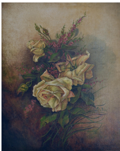
Yellow roses and heather, special flowers for Dick and Helaine Dunmire

(If you are interested in reading the complete text of Annelise's speech, we will publish a copy on the WHS website)