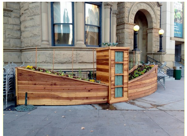
Beautiful garden art and raised bed at San Jose Museum of Art. In April it will be sold to raise funds for Valley Verde, valleyverde.org.