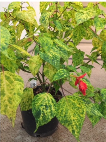
Salvia splendens van houttei 'Dancing Flame'