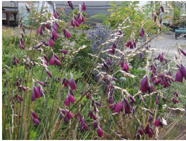
Dierama pulcherrimum 'Merlin'