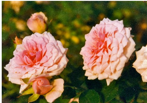
Miniature Rose 'Lovely Lorrie'

Unfortunately the horticulture community has suffered the loss of more of our friends in recent months.