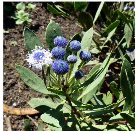
Globularia x indubia

It looks like the plant notes were written this month by Betsy Clebsch, she described three carnivorous plants, Nepenthes merabilis , Sarracenia purpurea and Drosera and warned that "Beware, these plants may eat your favorite fly!" Other plants on display were two introduced by Wintergreen Nursery and shown by Barbara Worl on behalf of Allcin Rauzin: Allium splendens and Globularia x indubia ; Barbara also showed an aster sp. blooming about 2 1/2' tall, the colors changing from pale lavender to pale pink, but "The stamens are pink and stay that way giving the flower a sparkle." Day Bodderoff brought two grasses, Carex elegantissima