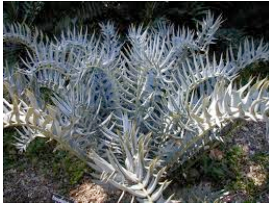
Encephalartos horridus , an unusual and rare cycad from South Africa. Read all about it: cycadsociety.org/horridus/horridus.html .