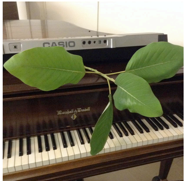
Huge leaves! Plant discussion, February 2014.