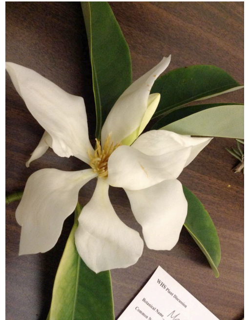
Unusual Magnolia brought to the February 2014 plant discussion.