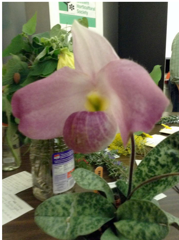
Unusual orchid? Plant discussion, February 2014.