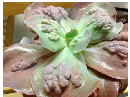
Echeveria 'Etna', a Hot Plant Pick in 2013.