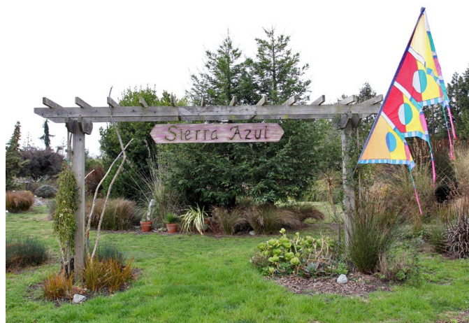
Entrance to display gardens at Sierra Azul Nursery