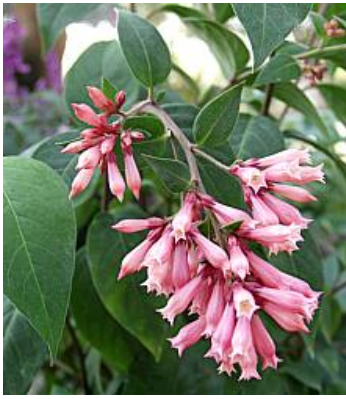
Cestrum elegans var. smithii

Cestrum elegans var. smithii (Pink Cestrum) – This fast growing evergreen shrub grows in full sun or shade (zones 8-11) in well-drained soil. It gets to be 8-10' tall x 4-6' wide. The opposite mid-green leaves are ovate with entire margins. Masses of lovely pink tubular flowers start appearing on arching stems in spring and continue through summer.