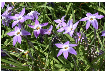
Ipheon uniflorum ‘Froyle Mill’