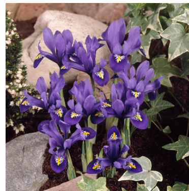
Iris reticulata ‘Harmony’

Iris reticulata ‘Harmony’ – This deciduous bulb grows in full to part sun (zones 5-9) and well-drained soil. It has gorgeous royal blue flowers with a white-rimmed gold crest on the falls (3 outer petals). The flowers are somewhat fragrant and grow on 6” tall stems, which begin blooming in the winter. The narrow sword-shaped leaves can get to be 15” long before disappearing in the spring as the plant enters its dormancy. It likes to be dry in the summer, so please do not water it since the plant is setting bulbs for the following year.