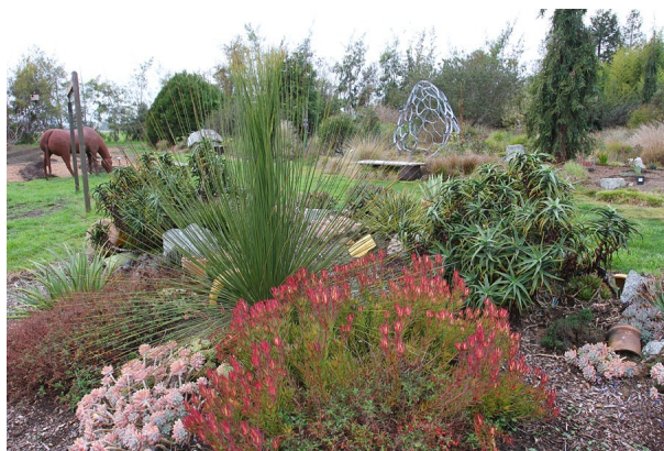
Mound with Dasyllirion longissimum and Leucadendron salignum 'Winter Red' with garden art at Sierra Azul

Mediterranean Climate: Create Beauty with Appropriate Plants and Less Lawn