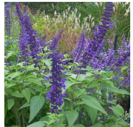
Salvia 'Anthony Parker'

Frances Parker who named it after her grandson. It grows in full to part sun (zones 8-10) in rich, well-drained soil. It generally grows to be 4' tall and wide, although Ted's is 5' wide. The broad gray-green leaves taper to a point. Deep blue-purple flowers appear on 2' long arching stems, which are still graceful even when the dark petals fall off. Like most salvias, hummingbirds love it.