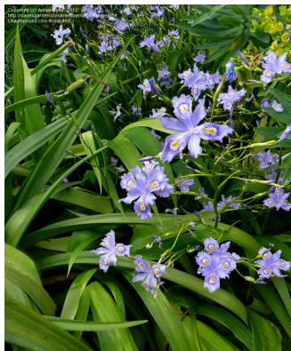
Iris confuse 'Chengdu'

Iris confuse (Bamboo Iris) -This evergreen perennial grows in full sun to part shade (zones 8b-11), although it does well growing in full fog for Ted. It forms a mat and gets to be 2-3' tall. The stems holding the leaves resemble bamboo. In the spring, clusters of beautiful white (species) or violet ('Chengdu') 2 1/2" flowers (as many as 75) appear and give off a vanilla fragrance. Be careful when pruning the leaves since the flowers are produced from these and appear the second year.