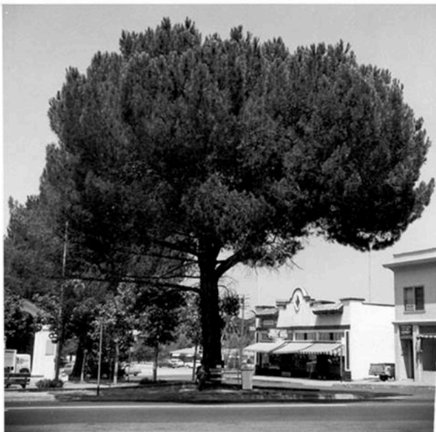
Italian Stone Pine.