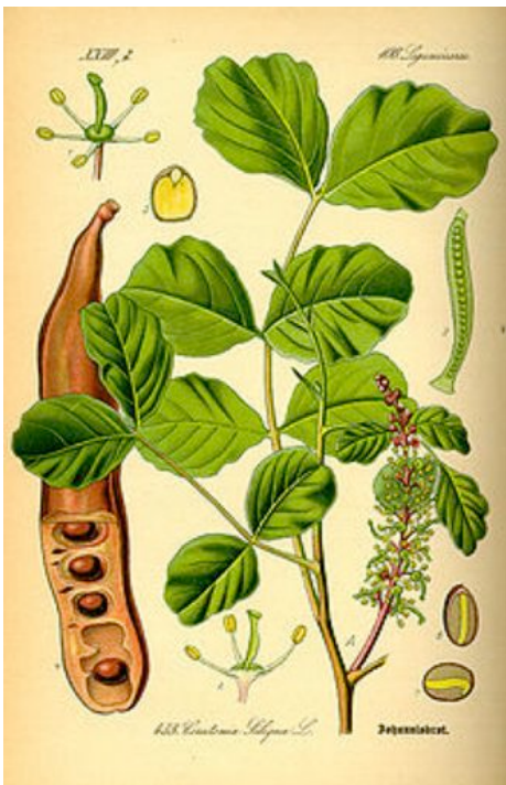
Ceratonia siliqua , commonly known as the Carob tree.

Sounds like a book recommendation for that special horticulturalist on your list! Happy Holidays!