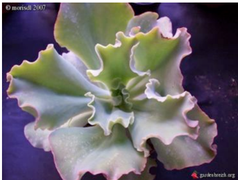
Echeveria crenulata x carnicolor.