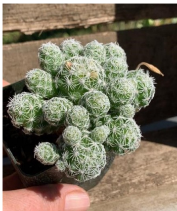
Mamillaria gracilis fragilis Thimble cactus

Mamillaria gracilis fragilis (Thimble cactus) This small, mounding pincushion cactus is native to Mexico and grows in full sun. It is densely covered with tiny white spines and produces offsets that can be used to start new plants, but grows fairly slowly for Nancy. It doesn't need a lot of water, especially if grown indoors. It is hardy to 30°.