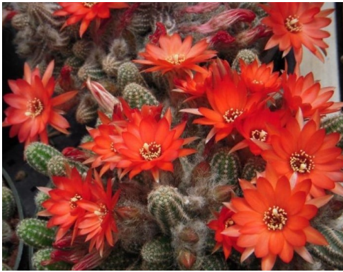
Chamaecereus silvestrii Peanut cactus