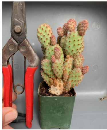
Opuntia rufida minima Cinnamon cactus