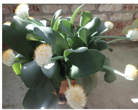
Haemanthus albiflos White paintbrush