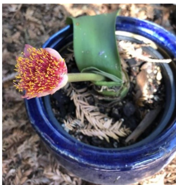
Haemanthus humilis albiflos x H. coccineus Deep pink paintbrush