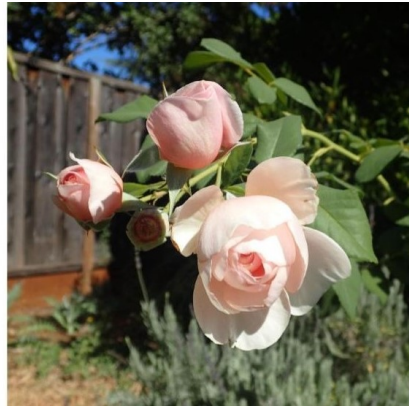
Rose 'Sceptor d' Isle'