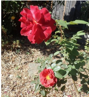
Rose 'Hot Cocoa'