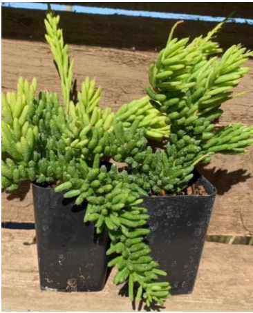
Rhipsalis mesembryanthemoides Clumpy mistletoe cactus