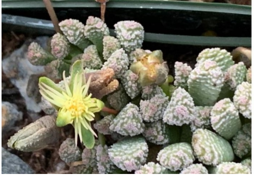
Titanopsis (schwantesii?) Warty living stone

Chamaecereus silvestrii (Peanut Cactus) – This cactus from Argentina blooms in the spring. The little nubs of this peanut cactus fall off and root easily. Just put 3-4 in a pot and they will fill in nicely. It really is easy to grow. Nancy showed a flat of them that she started last winter. There are some hybridized varieties that have large red, pink or yellow flowers but they also have bigger spines. She likes that she can handle this one and not get stuck by any spines while wearing thin nitrile gloves. It is frost hardy to 20° and it will scorch in hot sun. She found some good information online from Central Ohio Cactus and Succulent Society, which features a succulent of the month.