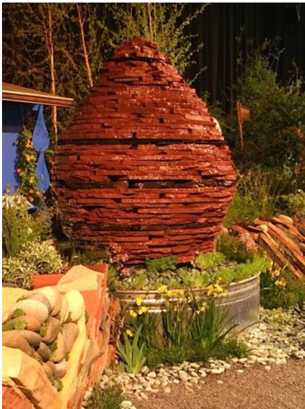
Water feature at the San Francisco Flower & Garden Show 2015 – filtering grey water from washing clothes into a garden fountain.