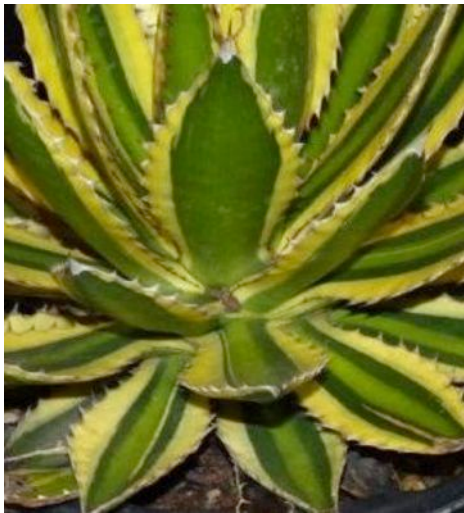
Agave lophantha 'Quadricolor', one of our Hot Plant Picks at the SFFGS 2015.