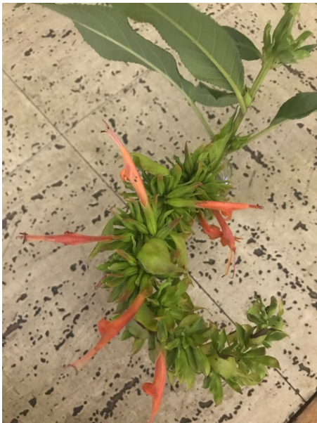
Salvia tuerckheimii (Dominican sage)

Salvia tuerckheimii (Dominican sage) – This large evergreen shrub comes from the mountains of the Dominican Republic. It grows in full sun (zones 9-11) in rich, well-drained soil. It gets to be 5’ tall x 5’ wide but Richard’s is only 2’ tall. It has large deep green, somewhat leathery leaves. Orange blossoms start appearing in the winter. Flowers by the Sea just started offering this plant last year.