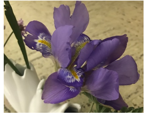
Iris unguicularis (winter-blooming iris)

fragrant, delicate, 2" purple flowers with a yellow striped fall and white netting on the throat. It flowers from late summer through winter in zones 7a – 9b and can tolerate temperatures down to 15°. It prefers dry but well-drained soil. Judy doesn't water it at all; she totally ignores it and grows it in part sun. Cut leaves down to 1/3 to 1/2 to show off flowers.