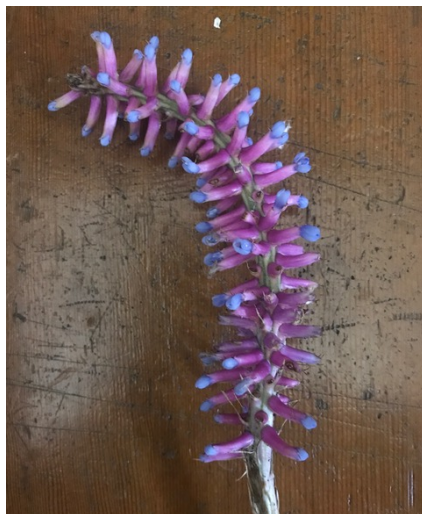
Aechmea gamosepala (matchstick bromeliad)

Aechmea gamosepala (matchstick bromeliad, matchstick plant) – This semi-epiphytic plant is native to Argentina and Brazil. It grows in shade to partial shade in (zones 8b-11) and gets to be 2' tall x 2' wide. It will grow mounted on bark, in a tree and in light well-draining soil. Just fill its cup/basin with water. Purple/bluish tipped, pink matchstick-like flower spikes start appearing in the winter and are followed by pink berries. It is hardy to 20°.