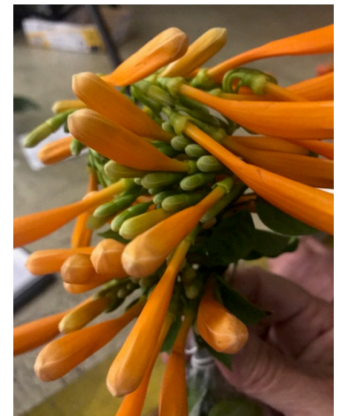
Pyrostegia venusta (flame vine)

tall) but 20' tall x 6-8' wide is more likely and it can be kept smaller with regular pruning. Pyrostegia means "red roof" and it really does look like a red roof that is hanging over whatever structure it is climbing. "Venustus" means beautiful which aptly describes its beautiful 2-3" orange, trumpet shape flowers. They start appearing in the fall and continue through winter before turning into 1' long slender capsules. It is hardy to 25° and if it dies back it will spring back quickly.