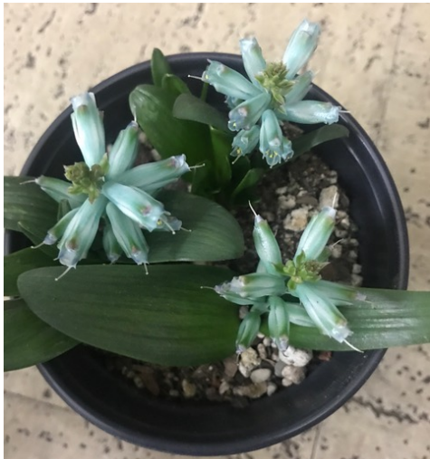
Lachenalia viridiflora (turquoise hyacinth)

Lachenalia viridiflora (turquoise hyacinth)-This unusual bulb is in the Hyacinthaceae family and is found in the Southwest Cape area of S Africa. The tubular turquoise flowers appear on 3-5" stalks in winter. Start watering in fall when the dark green strap-shape, succulent foliage starts to appear and allow to dry when the foliage starts to die back after flowering. It is found on granite outcrops, so is best grown in a pots with gravelly soil. It does best with temperatures of 50-70°F and at least partial sun during flowering. Judy keeps hers in a pot on the N side of her house.