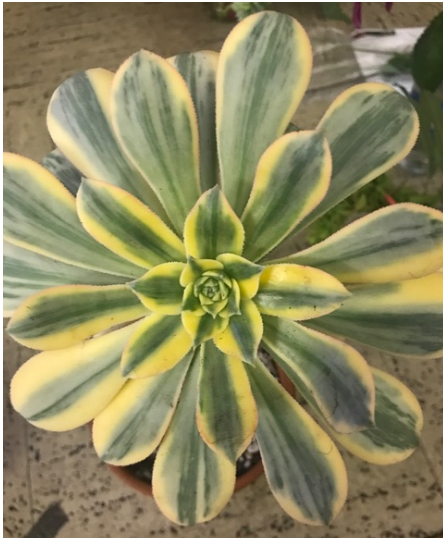
Aeonium 'Mardi Gras'

Aeonium 'Mardi Gras' – This is Judy’s favorite Aeonium . She bought this very colorful evergreen succulent at Home Depot. Vista Growers introduced it a couple of years ago. It derives its name from the wonderful color it displays in late fall to winter. Its stunning leaves usually have a thick middle green band that is surrounded by a yellow band and the edges can be a hue between rose to burgundy. Like all succulents it needs well-drained soil and it is hardy to 32°. Judy has it growing in part-sun.