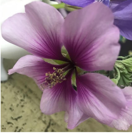
Lavatera maritima 'Bicolor' (tree mallow)

Lavatera maritima 'Bicolor' (tree mallow) – This medium size (to 8' tall and wide), fast growing evergreen shrub grows in sun to part shade. It has grey-green palmately lobed leaves. The flowers have magenta or dark pink centers and radiating veins on paler pink to white petals. Judy's is blooming even after the rains we've had. Because of its fast growth it is short lived and may only last 5 years. It is hardy to 20° and attracts birds and butterflies.