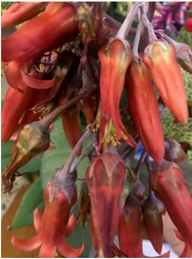
Cotyledon orbiculata (pig's ear)

Cotyledon orbiculata (pig's ear, white lady) – This showy, hardy succulent is from the deserts of South Africa. It grows in full sun to part shade (zones 9-10) in well-drained soil with very little water. It can grow to be 7' tall x 3' wide, almost shrub-like. It has silver ovate fleshy leaves that are trimmed in red. Showy bell shaped pink-orange flowers on upright silvery stems start blossoming in summer and continue until fall. It is hardy to the low 20's.