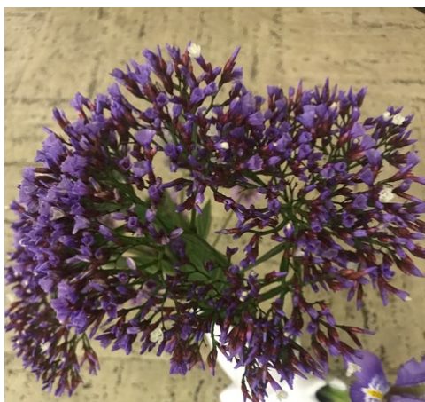
Limonium perezii (sea lavender)