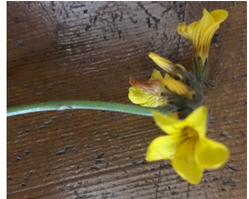
Oxalis frutescens (shrubby woodsorrel)

Oxalis frutescens (shrubby woodsorrel) – This subwoody perennial grows in full sun to partial shade (but not full shade) in well-drained soil. It grows to be 2' tall x 1-2' wide. It has pale yellow flowers, which are hermaphroditic (separate male and female flowers on the same plant).