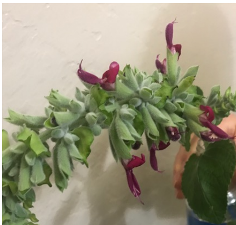
Salvia leucocephala (white-headed sage)