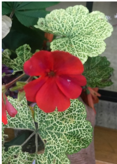
Pelargonium ‘Wantirna’ (meshed-leaf zonal geranium)