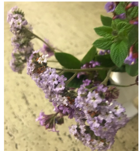
Verbena lilacina 'de la Mina' (purple Cedros Island verbena)

Verbena lilacina 'de la Mina' (purple Cedros Island verbena) – This small evergreen grows in sun and part sun (zones 7-10). It forms a tidy mound that gets to be 2' tall x 4' wide and grows in most soils but requires good drainage. Fern-like dissected leaves are a light green color. It has fragrant dark purple star-shaped flowers that attract butterflies and it blooms almost year round. This Mediterranean plant can go a long time without being watered. It is hardy to 20°.