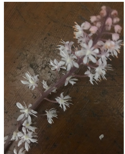
Tiarella wherryi (foam flower)

Tiarella wherryi (foam flower, coolwort) - This small, non-creeping, perennial grows in part sun to shade (zones 3-10) in moist, well-drained soil.