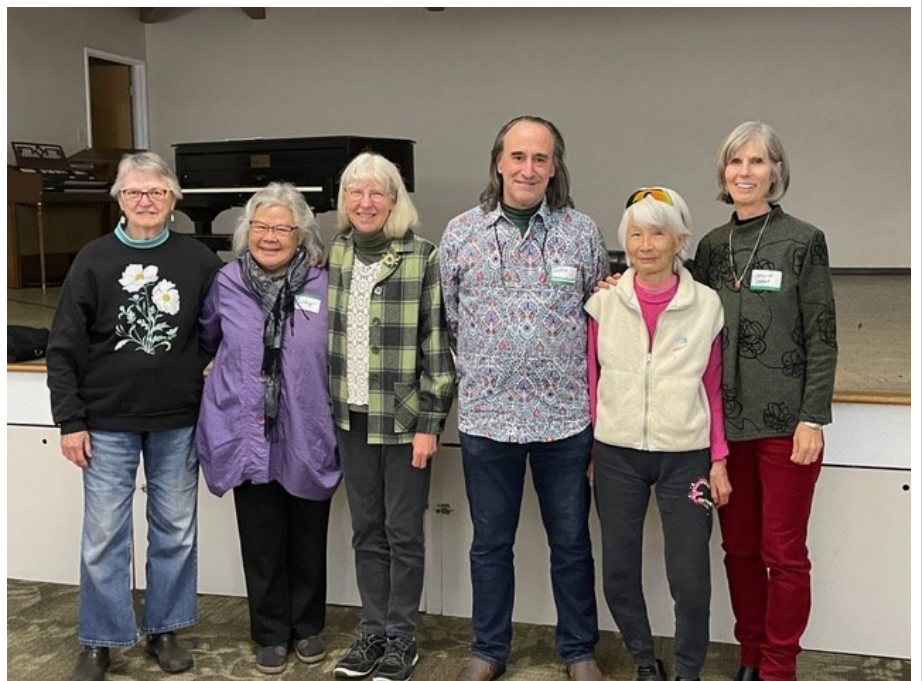
Previous Founder Award Recipients