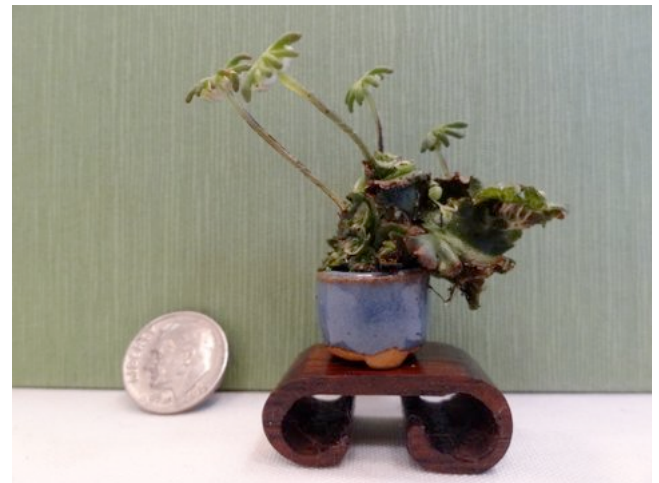
Liverwort Bonsai.