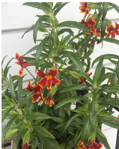
Mimulus 'Jelly Bean Fiesta Marigold'