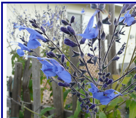
Salvia macrophylla