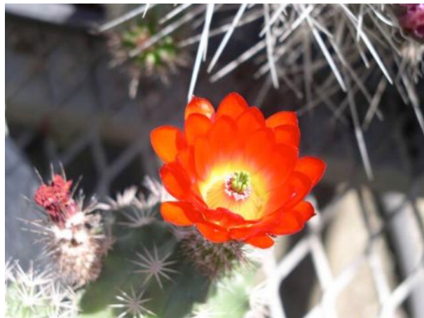
Photos above and below: At Poots Cactus Nursery, located on Hwy 120 in Ripon, California, just east of Manteca right on the way to Yosemite.